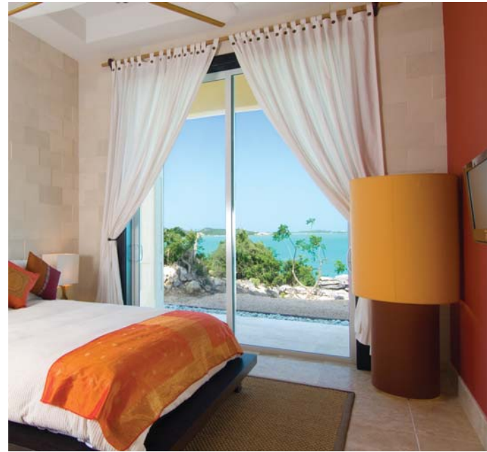
The guest bedrooms