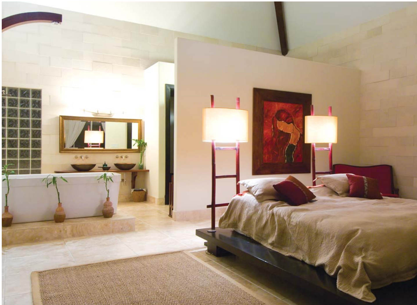
The master bedroom

are seductively beckoned to cross the high-arched bridge to find out. As it connects one end of the pool to the other, you courageously move along its curve and are led to a native limestone walkway with natural coral weaved intricately into its path.